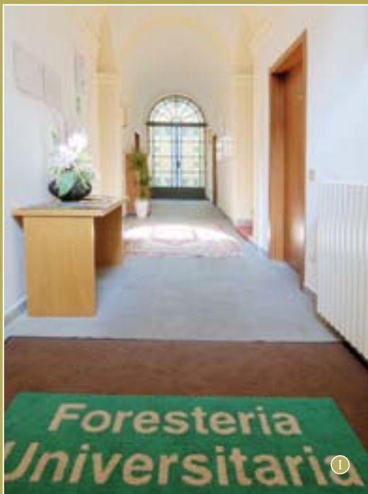
① The University Guesthouse