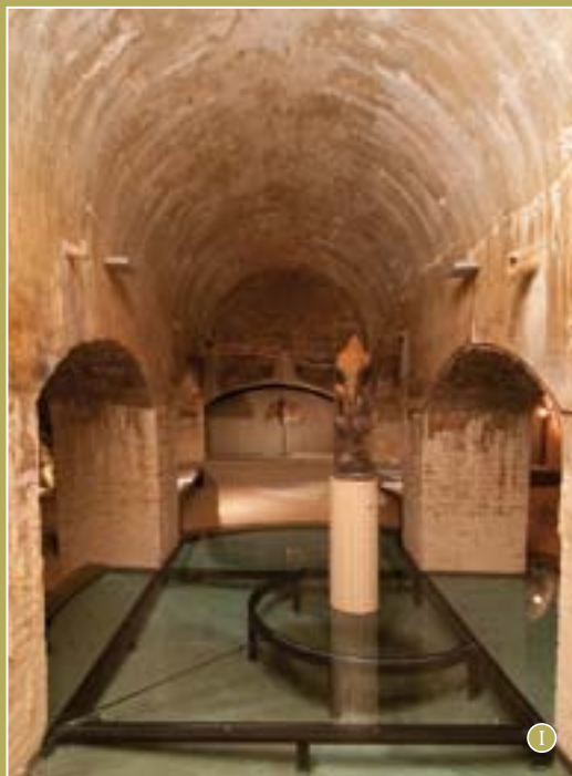
① The water tank