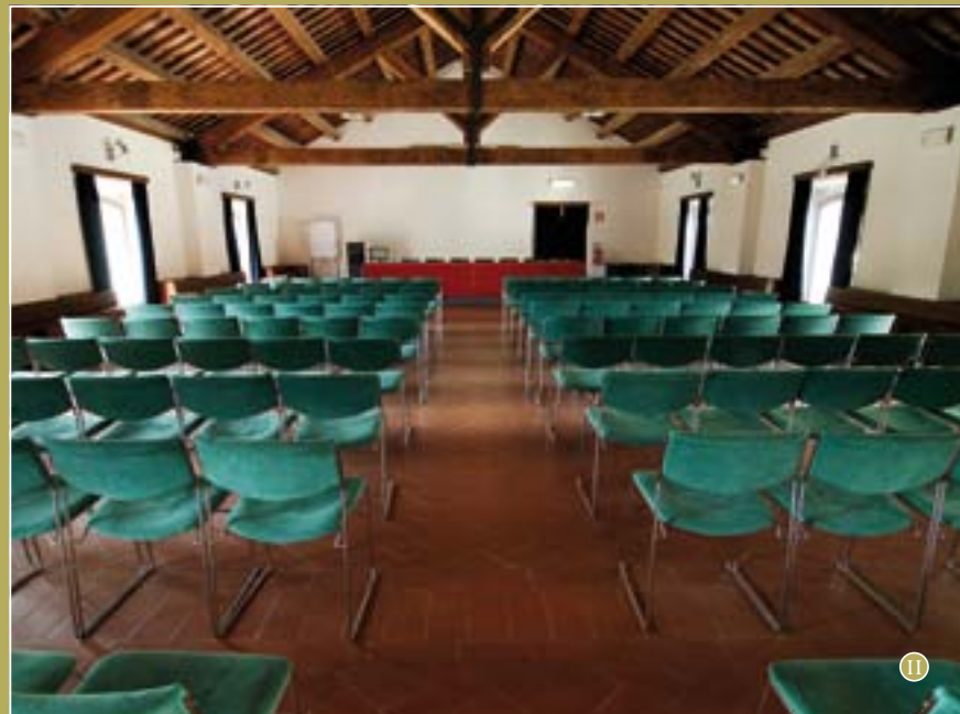
② The main classroom

All rooms are equipped with private bathroom, telephone, TV, data line connection system Wi-Fi and LAN.