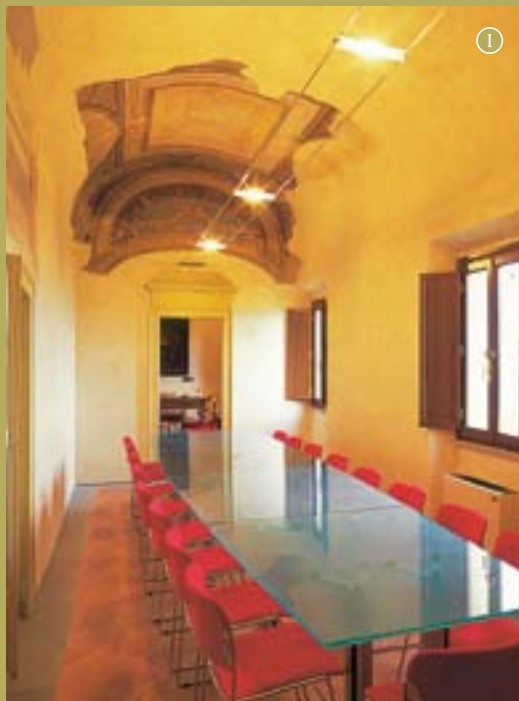
① The Council Room