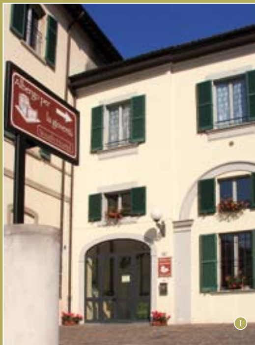
① The “Youth Hotel” in Santa Sofia