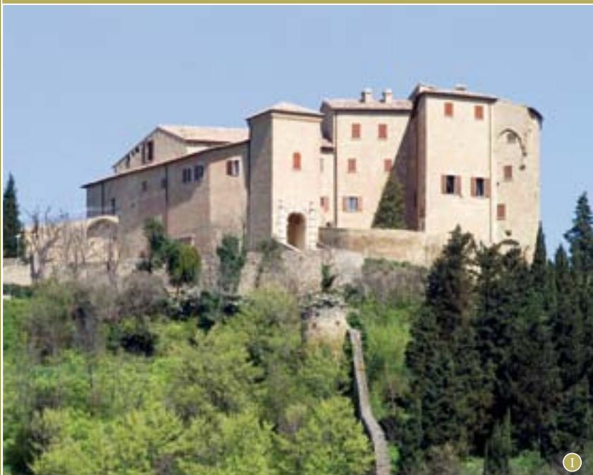
In front cover: the main entrance of the Fortress