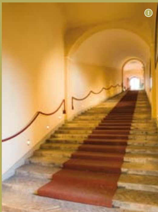
Ⓘ The stairwell of the Fortress